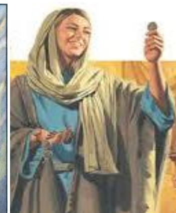
The Lost Sheep The Lost Coin

A warm welcome to all, especially those who are worshipping with us for the first time this morning. We hope your time here today will be a blessing to you, as your presence is a blessing to us.