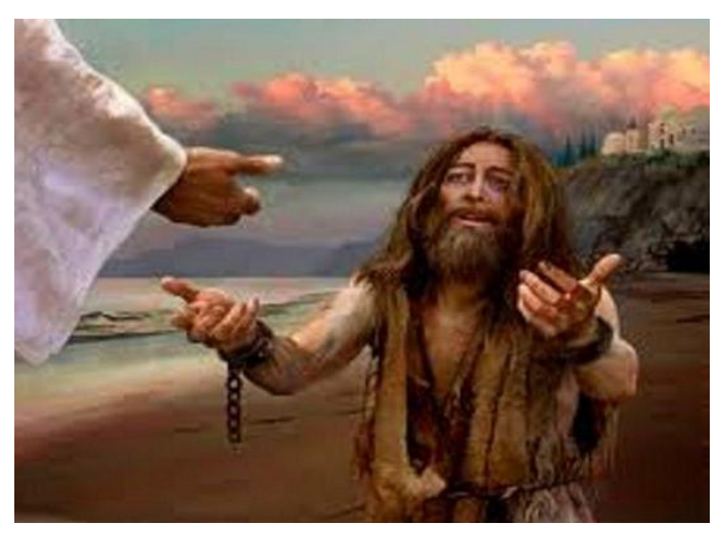
"Return to your home, and declare how much God has done for you."

8:30 a.m. - HOLY EUCHARIST BOOK OF COMMON PRAYER