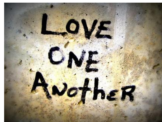
A New Commandment

(search: Parish of St. Margaret of Scotland)