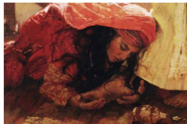
Jesus Anointed at Bethany

(search: Parish of St. Margaret of Scotland)