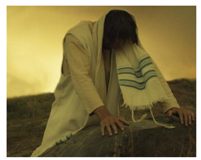
Jesus in the wilderness

8:30 a.m. - HOLY EUCHARIST BOOK OF COMMON PRAYER