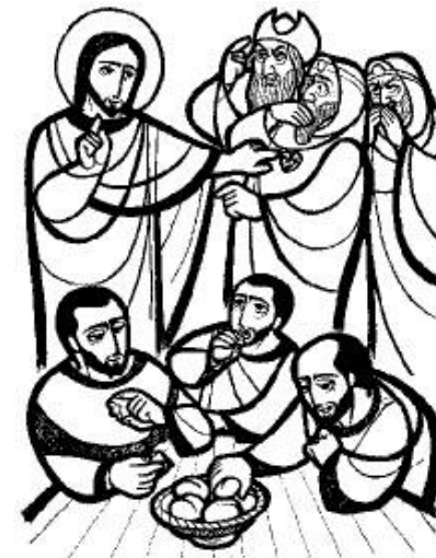
Clean Heart / Dirty Hands

(search: Parish of St. Margaret of Scotland)