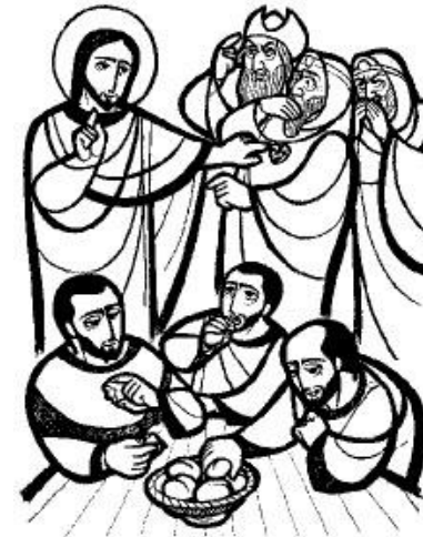
Clean Heart / Dirty Hands

(search: Parish of St. Margaret of Scotland)