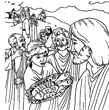
Jesus Feeds Five Thousand

(search: Parish of St. Margaret of Scotland)