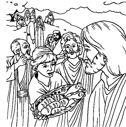
Jesus Feeds Five Thousand

(search: Parish of St. Margaret of Scotland)